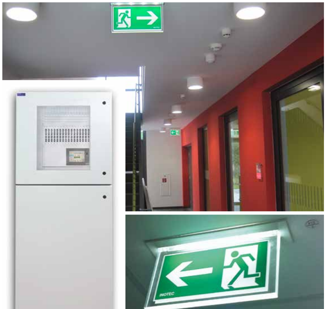
Figure 2: In emergency illumination systems (in the background you see a corridor in the Landesgymnasium für Musik Dresden (Dresden-based music high school of the state of Saxony)); the technology was supplied by Klett Ingenieur GmbH) systems of high-capacity common batteries are applied; on the left side you see Inotec's CPS220/64. When, in the case of a mains failure, these batteries have to stand in by supplying emergency power, the fuses may have to be able to cope with high DC short-circuits

A very typical field of application for fuses are the DC voltage circuits of emergency current supplies or emergency light systems. Very often, such systems are special in another way – in the normal operating mode, the systems are supplied with the typical mains voltage of 230 V AC, which, as such, does not present the fuses with a special challenge. It is only when the plant has to operate in the